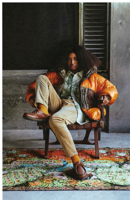
< Natal Design > Down Jacket ¥60,000 Shirts ¥10,000 Pants ¥10,000 | SCATTER BRAIN